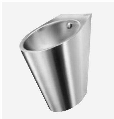
FINO stainless steel designer urinal Ref. DELABIE: 135710

Images available on our website delabie.com , in the PRESS section