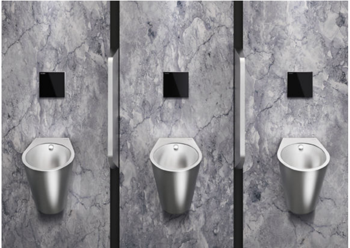
Ref. DELABIE: 135710

Industrial? Stainless steel? Think again! DELABIE combines expertise and creativity to reshape and reinterpret stainless steel.