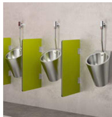
FINO stainless steel urinal installation example