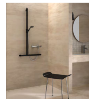
Installation example: Be-Line® black T-shaped grab bar Ref DELABIE 511944BK