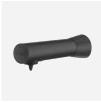
Electronic liquid soap or hydroalcoholic gel dispenser

New matte black electronic soap dispenser