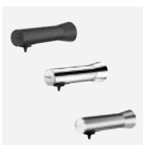
Design: available in 3 finishes