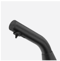
Deck-mounted liquid soap dispenser