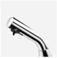
BINOPTIC basin-mounted electronic soap dispenser, chrome-plated

BINOPTIC basin-mounted electronic soap dispenser